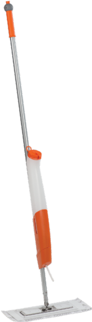
Contec Floor Mop System (ATFM0001) shown with Premira II Microfiber Pad (PRMM0001) and Premira Hygienic Backer Plate (HCPH8005)