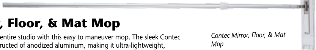
Contec Mirror, Floor, & Mat Mop