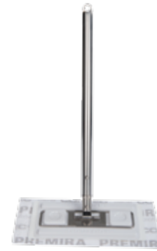
PREMIRA Tight Quarters Mop